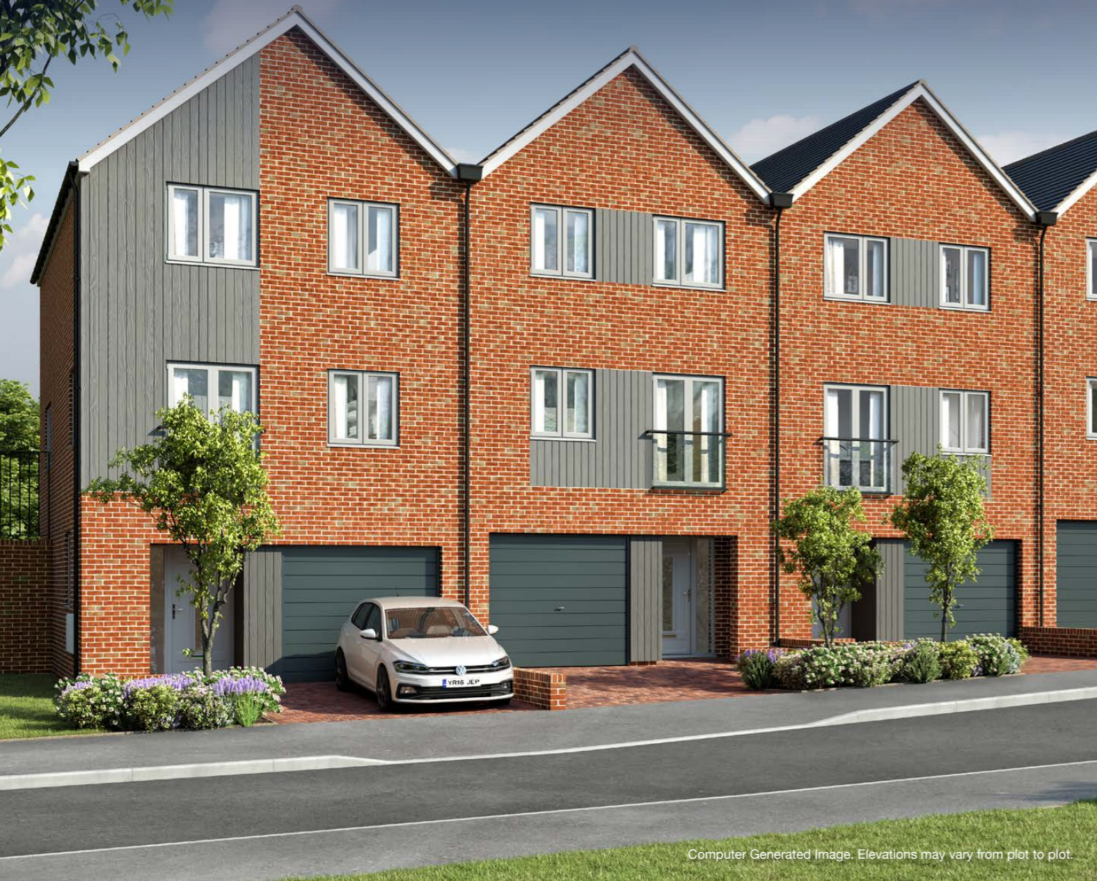
Computer Generated Image. Elevations may vary from plot to plot.